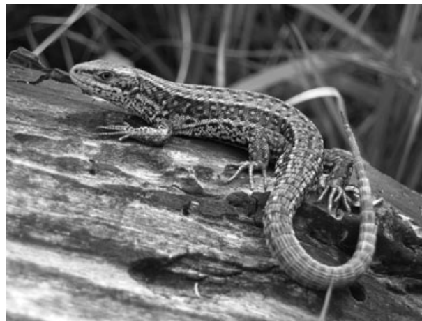
Fig. 1. Adult male of the species Zootoca vivipara (European common lizard) at an outdoor enclosure in the CEREEP, France (48°17'N, 2°41'E).

To circumvent these previous limitations of foraging ecology studies, it is important to conduct experiments in natural conditions to obtain realistic estimates that capture the effects of body size, density and climate conditions on the foraging success of diverse species. This study achieves this important goal by investigating natural feeding rates of the European common lizard Zootoca vivipara Jacquin (Fig. 1) in outdoor enclosures. Z. vivipara is a small ovoviviparous lizard that preys opportunistically on diverse invertebrate species (Avery 1966; see also Appendix S1, Supporting Information). Our goals were to: (i) gain an understanding of the factors influencing prey consumption in Z. vivipara by using a comprehensive approach that incorporates individual, population and environmental effects; (ii) identify the most parsimonious feeding rate function considering diverse allometric and density-dependent functions; and (iii) investi-